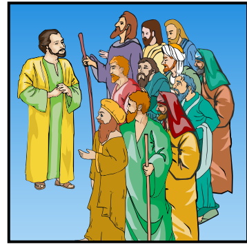
Joseph & his brothers

Describe a time when you had a disagreement with a friend or family member, and how you were able to work with them to resolve the disagreement.