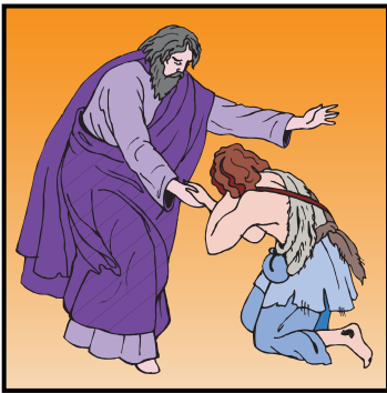
The prodigal son

Did these Bible characters follow Jesus' instructions? Was it easy for them to make peace? How did they make things right?